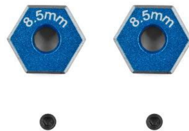
#72258 – 8.5mm

MAP: $15.29 MSRP: $17.99 COO: Tiawan Barcode: 784695722576