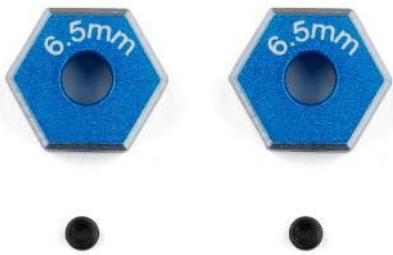
#72257 – 6.5mm

Introducing the new 6.5mm and 8.5mm FT aluminum wheel hexes for the DC10 platform! Use the included set screw to lock down your wheel hex to reduce the chances of the wheel pin falling out. This upgrade provides a nice blue finish with a post-operation chamfer that shines silver while also allowing for an easier offset change.