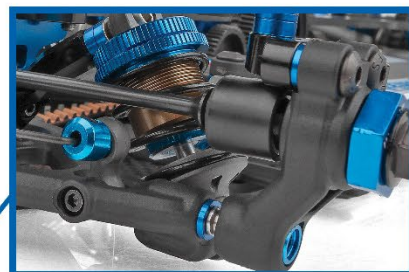
Pillow Ball Lower Arm Design