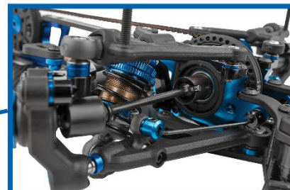
Long-Arm Pivot Ball Suspension Geometry