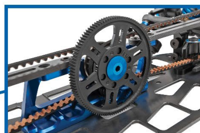
Mid-Motor Configuration with Symmetrical Belts