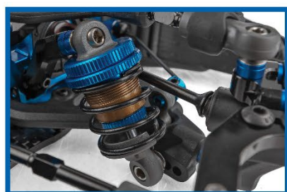
Centralized Ultra-Short Shock Design