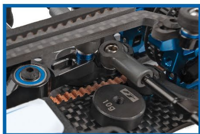
Floating One-Piece Servo and Bell Crank Mount