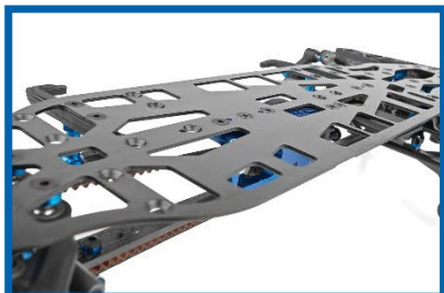
TC8 Steel-Spec Chassis